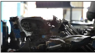
4. Open The Mould