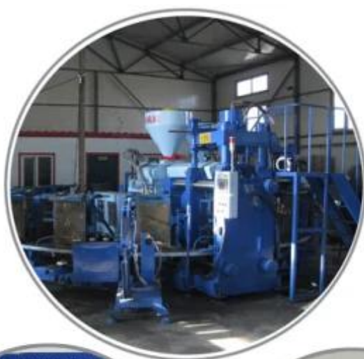
Automatic Injection Molding Machine

Thank you for your interest of Tiger Master, hope you can find the products you want and start our business cooperation. If you need more information, please do not hesitate to contact us, we are always ready here.