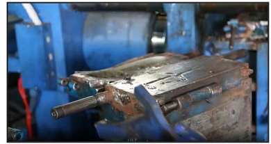
3. PVC Injection