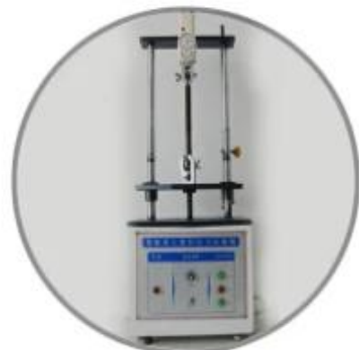
Tensile testing machine