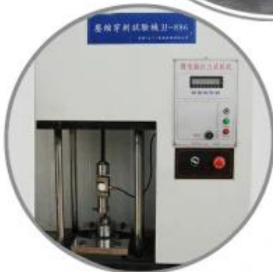
Puncture Testing Machine