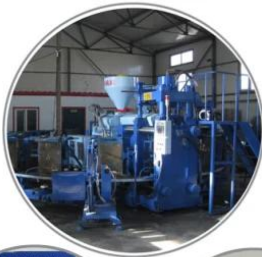
Automatic Injection Molding Machine

Thank you for your interest of Tiger Master, hope you can find the products you want and start our business cooperation. If you need more information, please do not hesitate to contact us, we are always ready here.