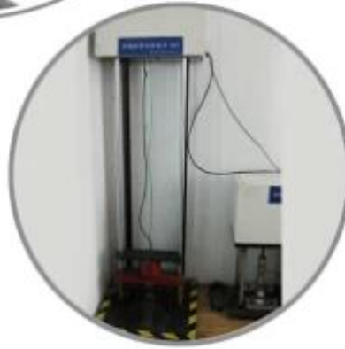
Impact Resistant Testing Machine