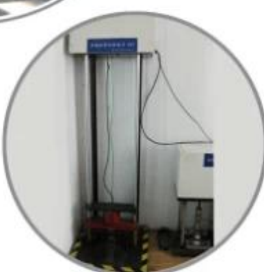
Impact Resistant Testing Machine