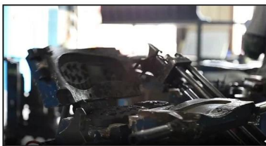
4. Open The Mould