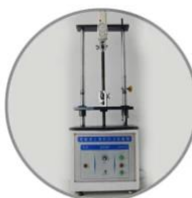
Tensile testing machine