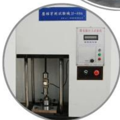
Puncture Testing Machine