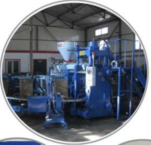
Automatic Injection Molding Machine