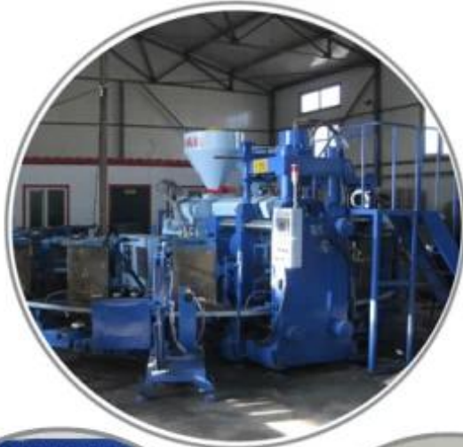
Automatic Injection Molding Machine