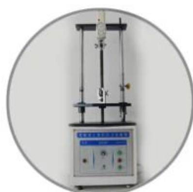
Tensile testing machine