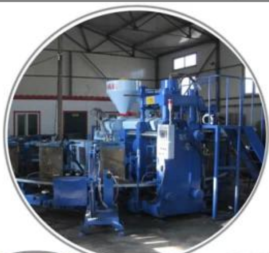
Automatic Injection Molding Machine