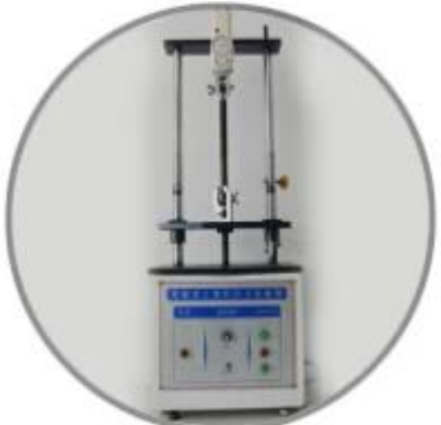
Tensile testing machine