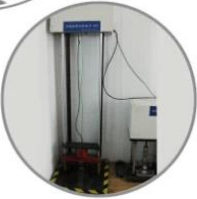
Impact Resistant Testing Machine