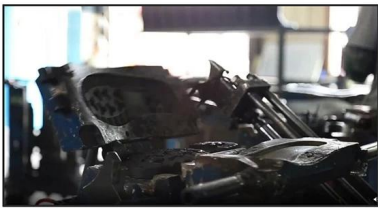
4. Open The Mould