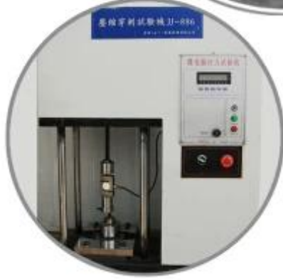
Puncture Testing Machine