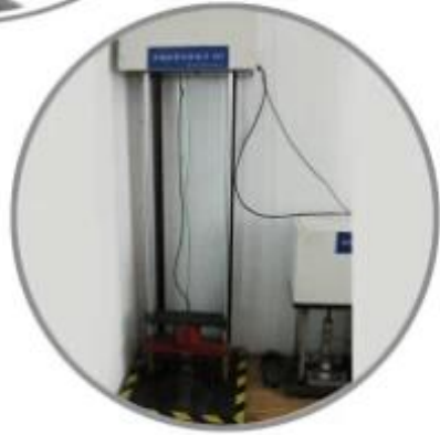
Impact Resistant Testing Machine