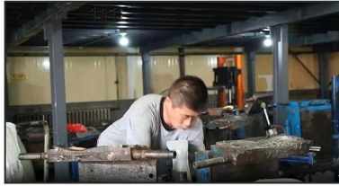
2. Putting Polyester Lining