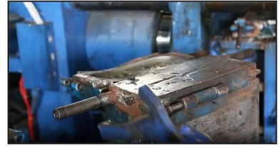
3. PVC Injection