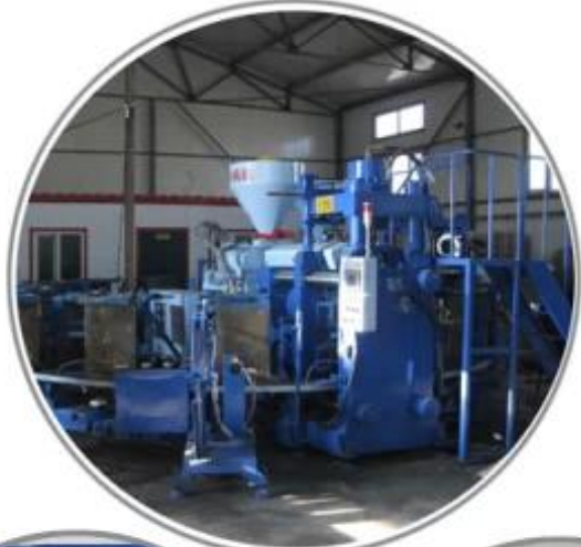
Automatic Injection Molding Machine