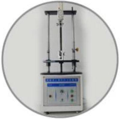
Tensile testing machine