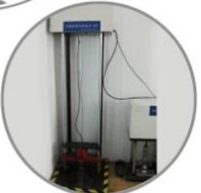
Impact Resistant Testing Machine