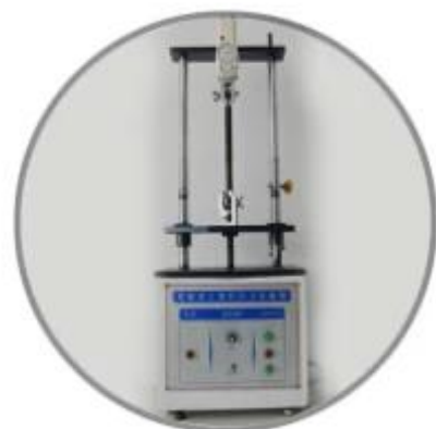
Tensile testing machine