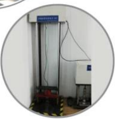
Impact Resistant Testing Machine