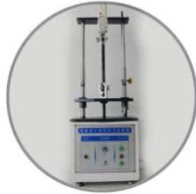
Tensile testing machine